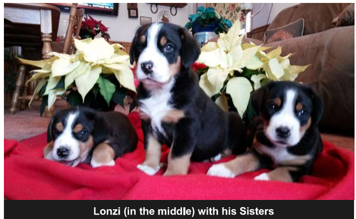
Lonzi (in the middle) with his Sisters