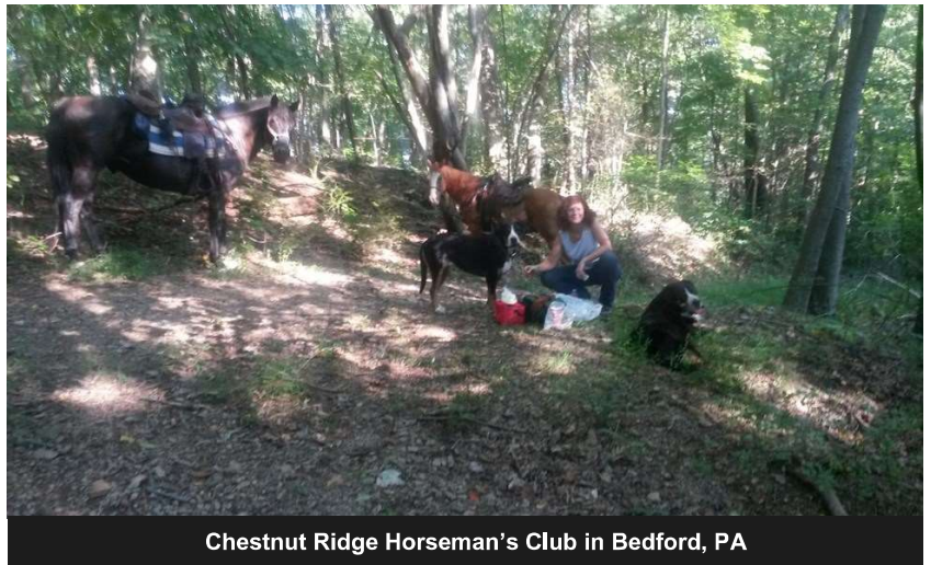
Chestnut Ridge Horseman's Club in Bedford, PA

they just make us laugh. They have such unique mannerisms and personalities that continue to bring us a lot of joy!