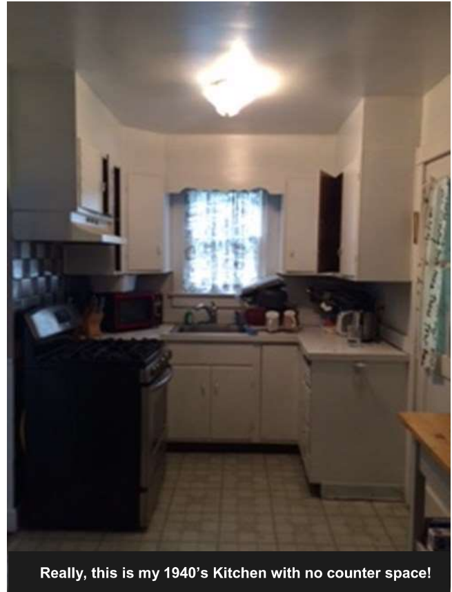
Really, this is my 1940's Kitchen with no counter space!