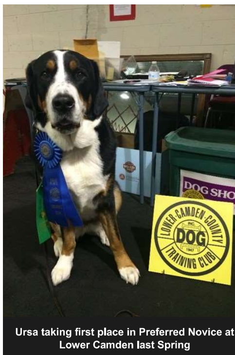
Ursa taking first place in Preferred Novice at Lower Camden last Spring